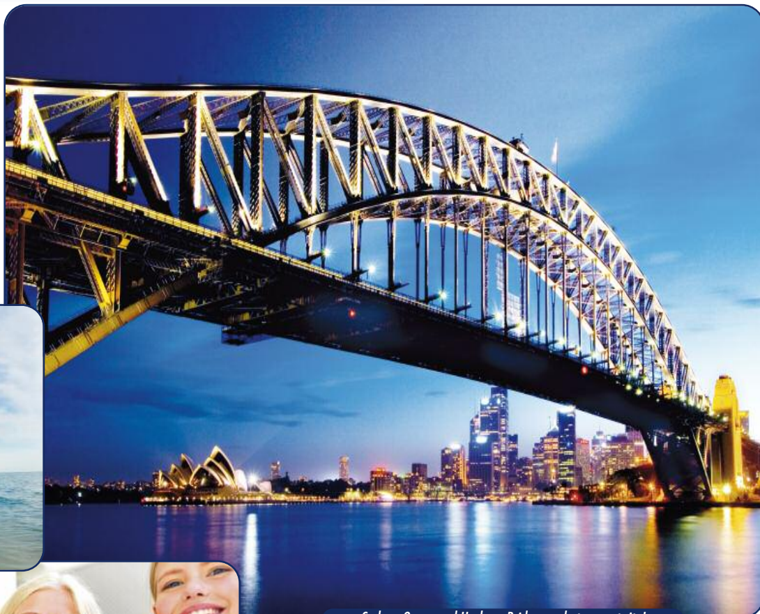
Sydney Opera and Harbour Bridge – what a great city!