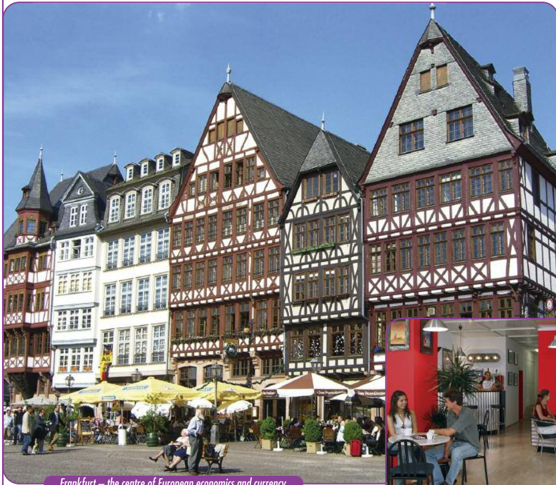
Frankfurt – the centre of European economics and currency.

Frankfurt stands on the banks of the River Main and is the centre of Europe's economy and currency.